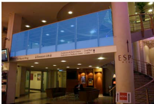
HOTEL LOBBY 1 ST FLOOR

The EPSC Banner will be on the first floor Lobby of the Hotel. Stars sponsorship can have their logo included on the bottom part of the banner. PVC fabric in wood frame, total h=1.35mx5.4m