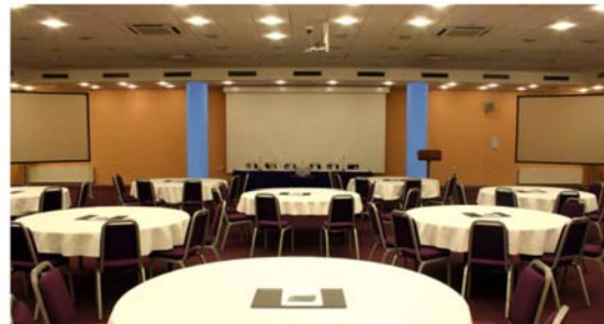
2 ND FLOOR – ALFA HALL

2 pieces, PVC fabric around column, Diameter=1.8mx2.95m