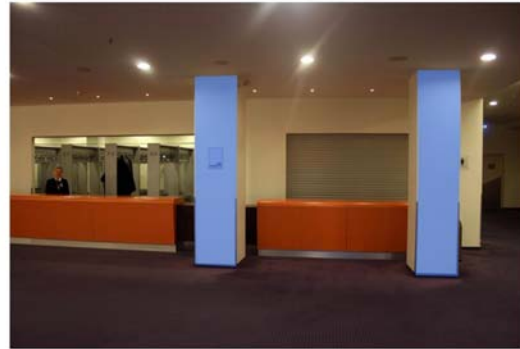
2 ND FLOOR HALL 2

2 pieces, Printed PVC plates, h=2.88mx0.6m